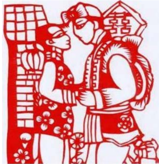
Fig.5 Paper-cut of "Walking to Xikou"