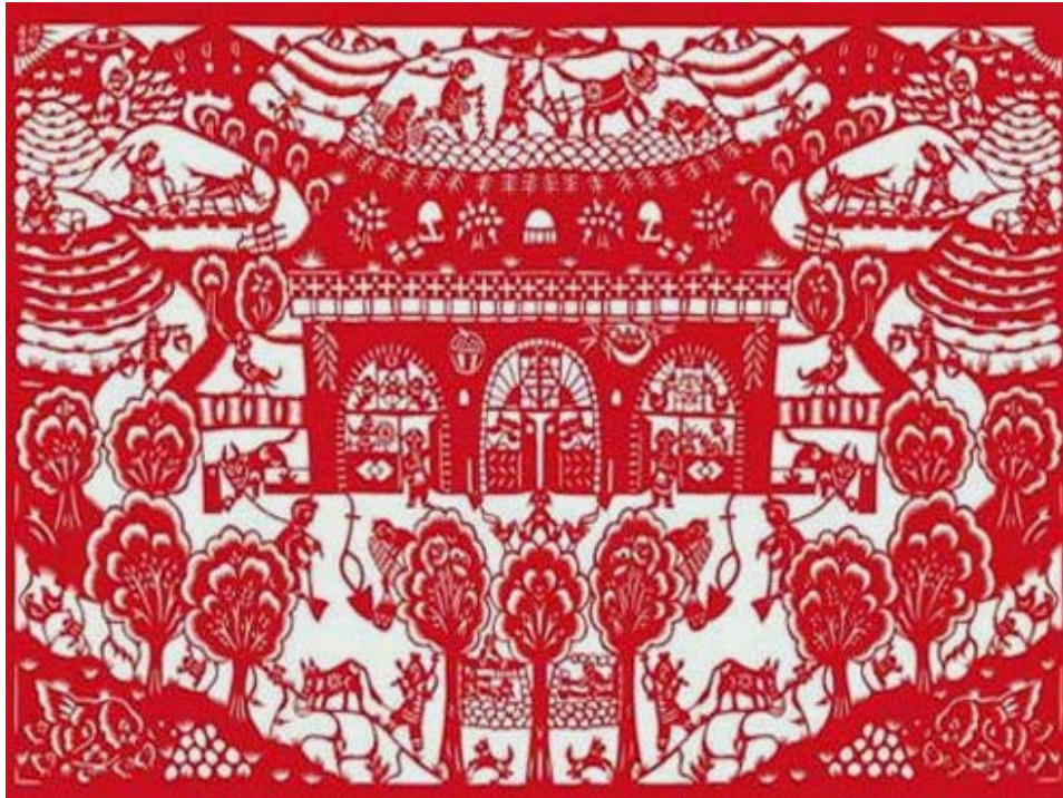
Figure 1 Practical paper-cut

the process of marriage customs. There are also some "tuanhua", "kiln top flower", "ceiling flower" and "tent house flower" on the roof of the cave. In a word, all kinds of plant and animal life are combined to form a paper-cut life form with deep symbolic connotation, which can form deep predictions and blessings to achieve psychological balance and spiritual consolation [1-3]. Fig. 1 Practical paper-cut.