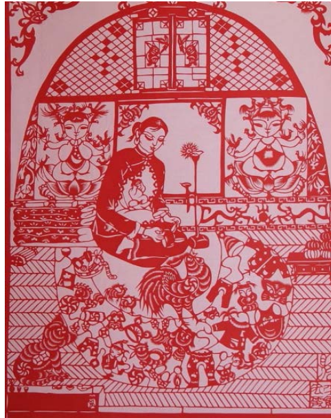
Figure 4 Aunt-in-law's paper-cut

and the scene is lively. The woman who cooks looks at the Magpies on the trees with flowers on her head. The whole picture shows the happiness and warmth of family life. Fig. 4 Aunt-in-law's paper-cut.