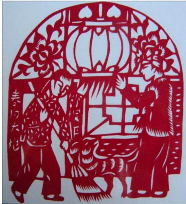
Figure 6 Animation Modeling of Orchid Flower