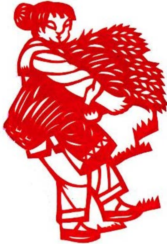
Figure 3 Regional paper-cut

Because of its special geographical position, the paper-cut in northern Shaanxi has become irregular, which largely retains the original art of simple, simple artistic character and straightforward, concise expression. In a relatively free creative environment, people have completed vigorous paper-cut works. These paper-cuts are like the songs of Xintianyou sung by local people. The ancient rhythm is full of extraordinary vitality, which is a natural expression of purity and passion. Paper-cut in northern Shaanxi is a cultural form growing up on the land of northern Shaanxi, which has the characteristics quite different from those in other places [6]. Fig. 3 Regional paper-cut.